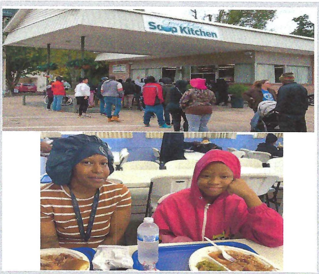
We are able to serve an average of 1,000 meals weekly !!