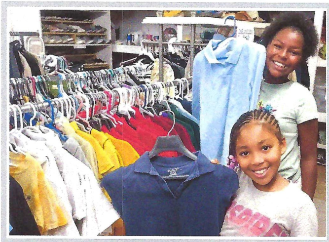
People in need are allowed to receive the nicest clothing, shoes, housewares, & hygiene items (at no charge), thanks to the kindness and generosity of all who donate!

Jesus instructed "Let the little children come to me, and do not hinder them, for the kingdom of God belongs to such as these." Mark 10:14