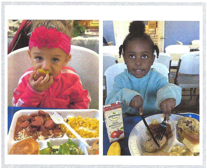
About 1/2 of the people we serve in the summer are children! It is so exciting to see them grow & offer them LOVE and HOPE!

Jesus asked Peter 3 times if he loved Him, in John 21. Then Jesus commanded him to: "feed His lambs" & "feed His sheep"