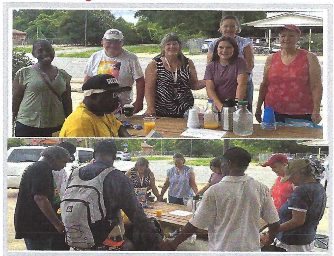
Every Monday morning a time of devotion and prayer is offered to everyone, including music and breakfast!

In the parable of the sheep & goats, Jesus teaches us that whenever we clothe someone in need, we are doing it directly for Him! Matthew 25:36